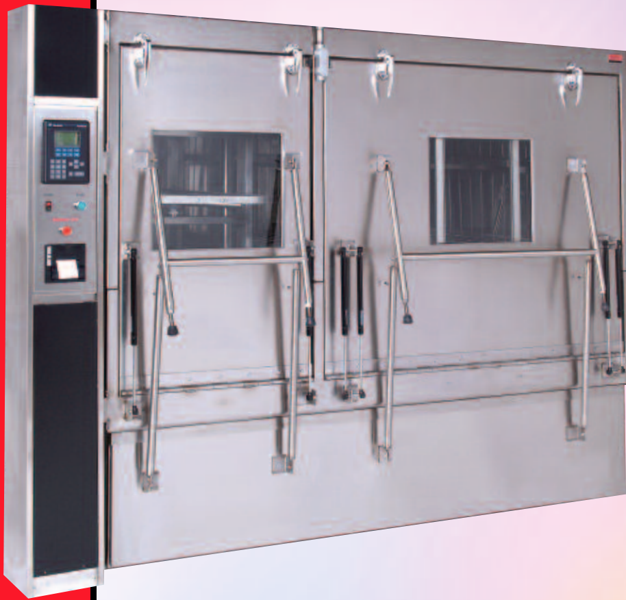
Cage/Bottle Washer Model 2 Special

Since 1987, Buxton has manufactured Washers to the high-performance and standards expected by healthcare, animal care, laboratories, and bio-pharmaceutical clients.