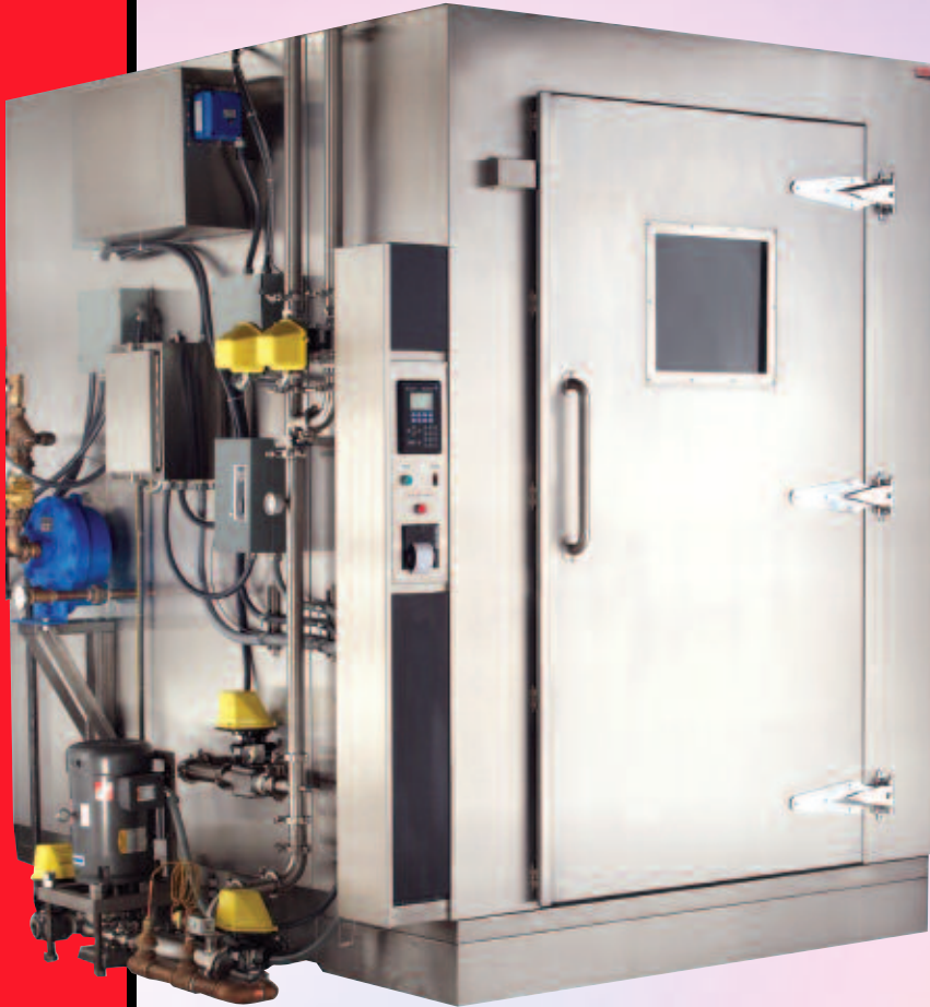
Walk-In Washer Model 3

Since 1987, Buxton has manufactured Washers to the high-performance and standards expected by healthcare, animal care, laboratories, and bio-pharmaceutical clients.